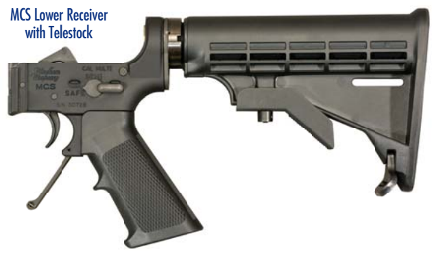
MCS Lower Receiver with Telestock

Windham Weaponry Pricing Information: Part# RMCS-3 M.S.R.P. UPC $2391.00 848037040442