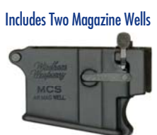
For .223/5.56, .300 Blackout & 7.62 Calibers (AR Type Mag)