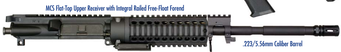
MCS Flat-Top Upper Receiver with Integral Railed Free-Float Forend