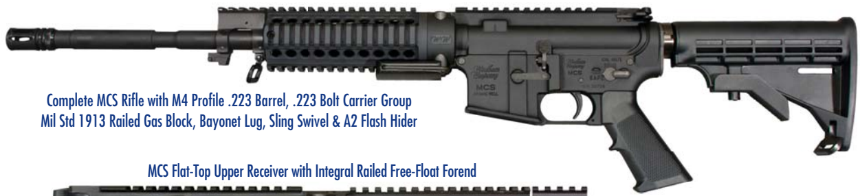
Complete MCS Rifle with M4 Profile .223 Barrel, .223 Bolt Carrier Group Mil Std 1913 Railed Gas Block, Bayonet Lug, Sling Swivel & A2 Flash Hider