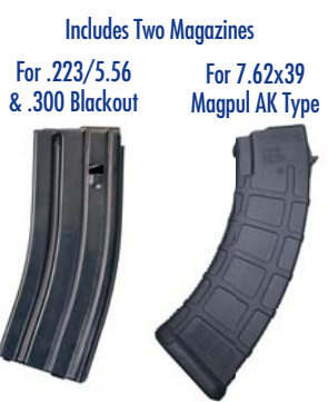
Includes Two Magazines