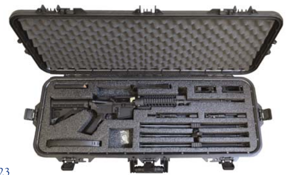
Complete RMCS-3 System shown in case in this photo.

RMCS-3 System Ships in a Heavy Duty, Custom Die Cut, Foam Lined, Lockable Rifle Case.