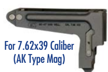
For 7.62x39 Caliber (AK Type Mag)